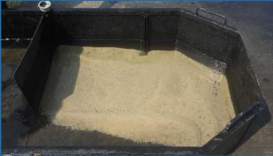
Debris lifted from well sump

Pulling out 2-3/8" pipe and airlift tubing.