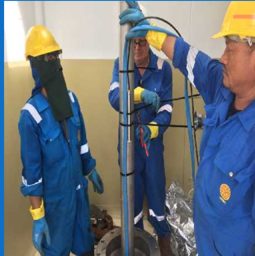
Re-install pump and transducer