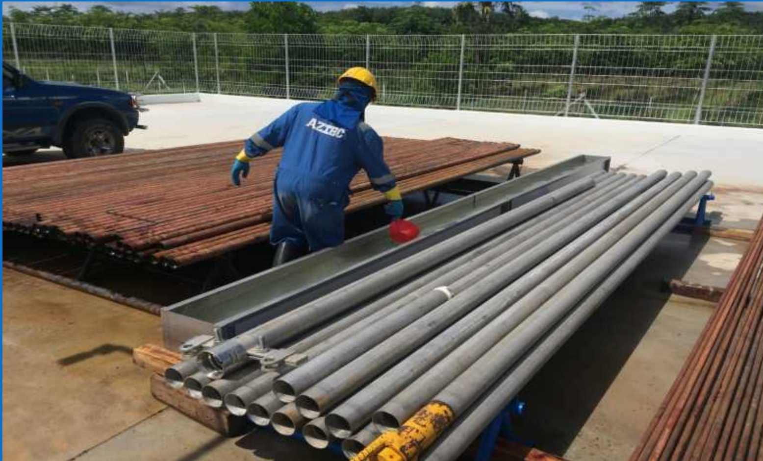
Clean pump and column pipe