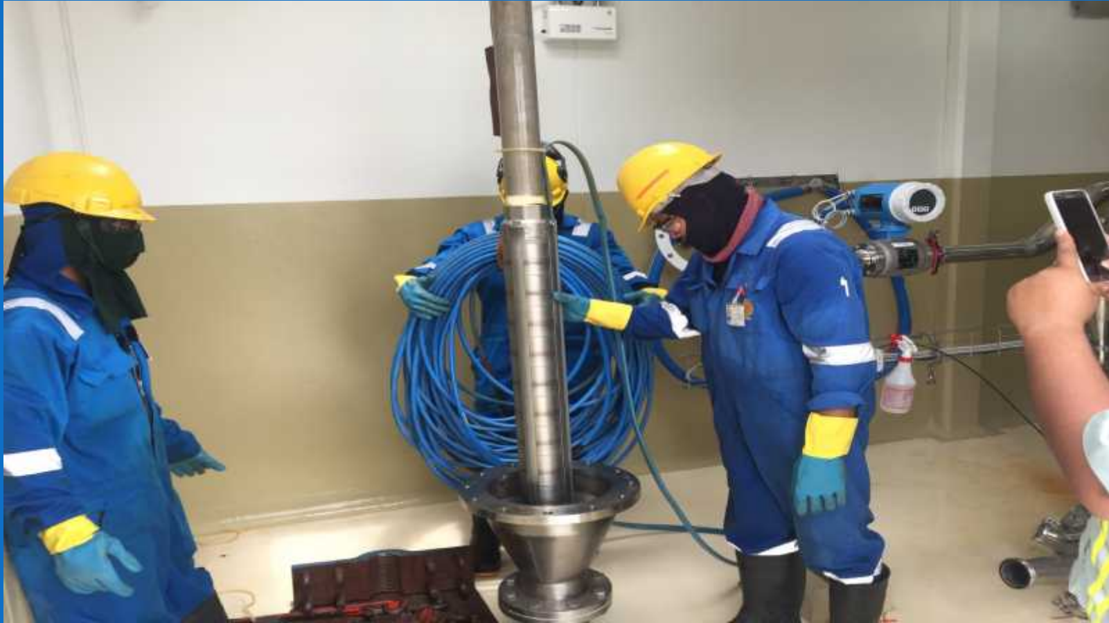
Pull production pump and column pipe