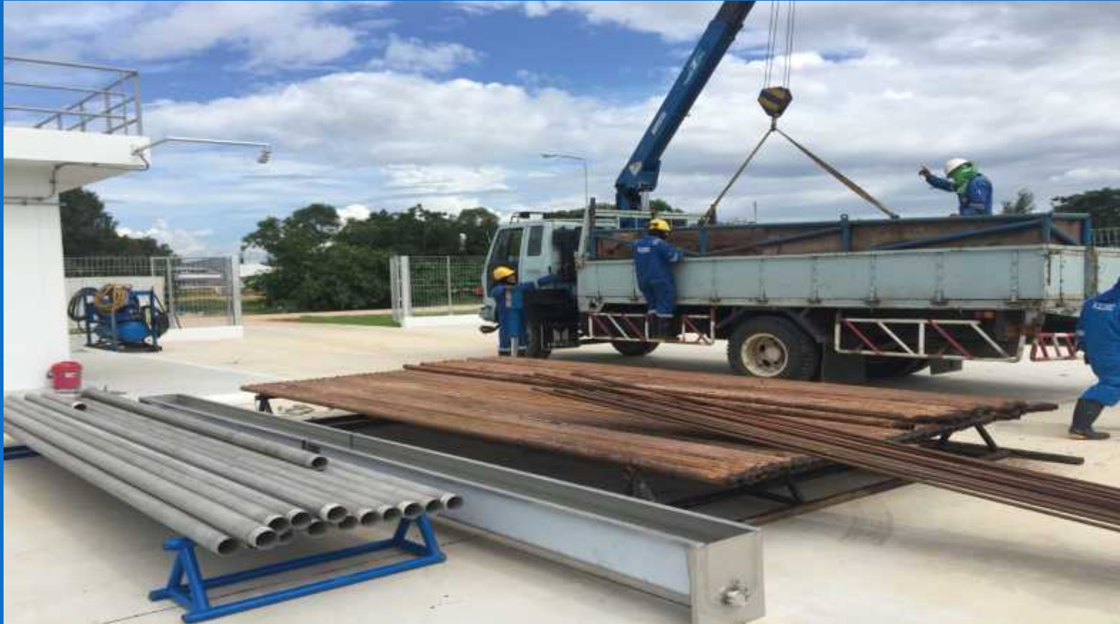
Prepare & Unload equipment